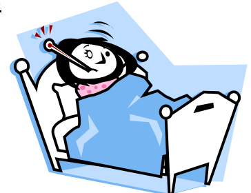
I'm sick Mom!

We are cautious regarding flu symptoms. We try not to inconvenience parents and at the same time being cautious of maladies that can spread to all of the children. Thank you