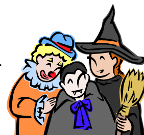
No Costumes Please!

We will lay all of the ground work for our families to have a wonderfully fun Halloween night. Enjoy!